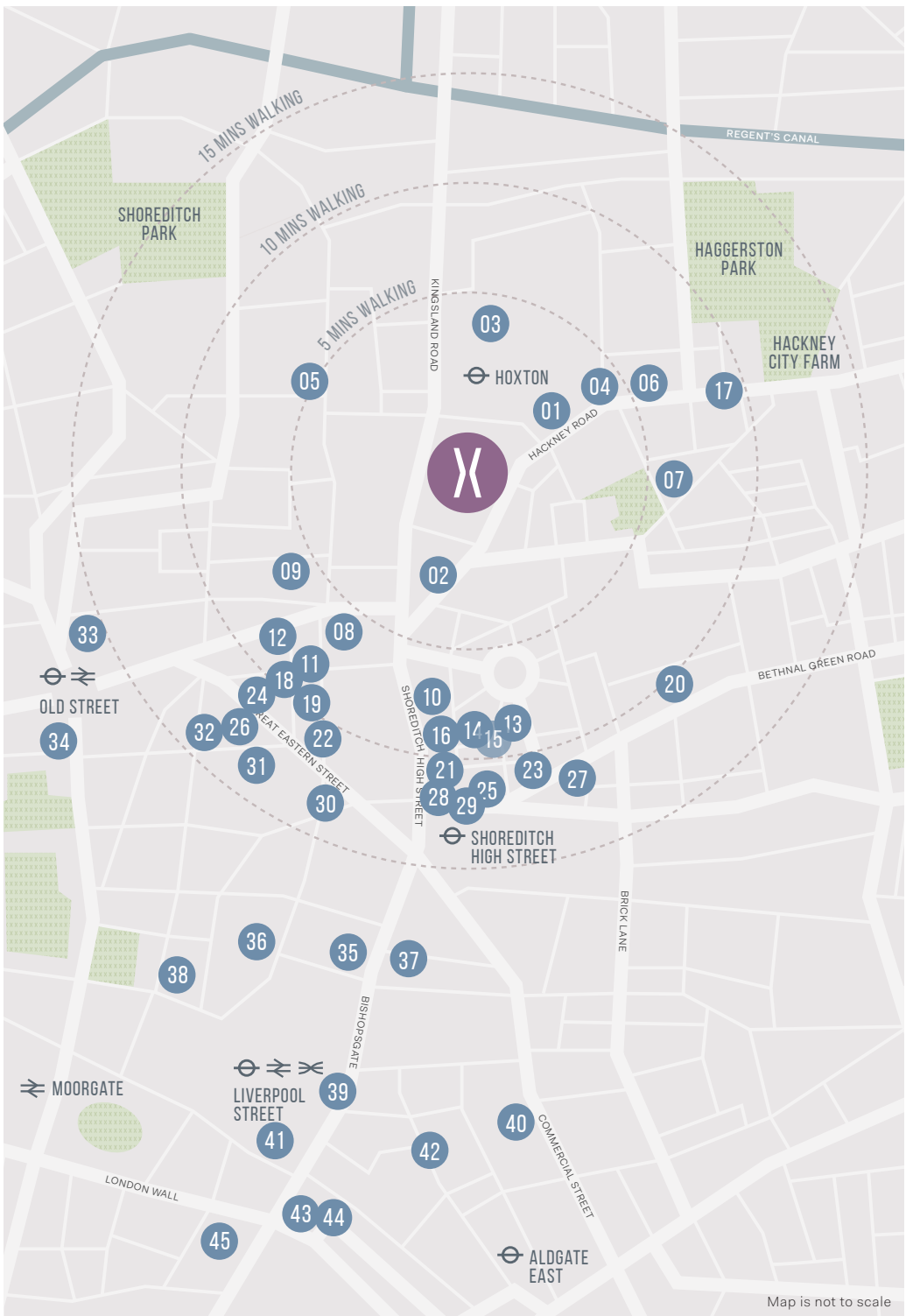
Map is not to scale